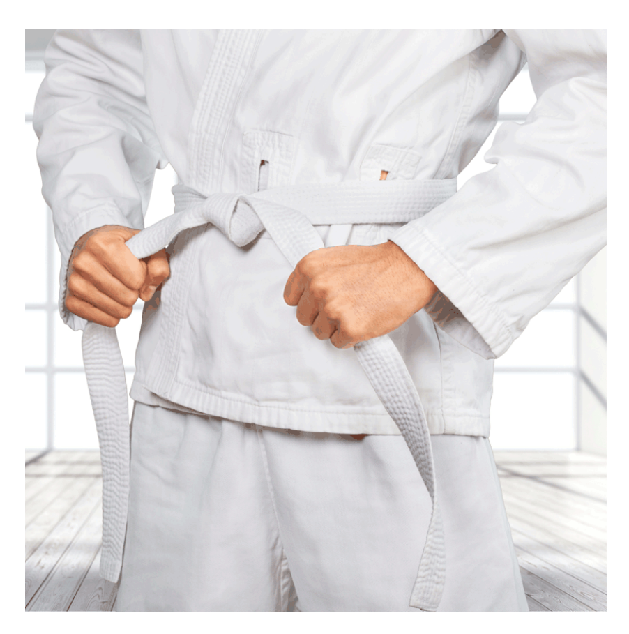
And what to do about it