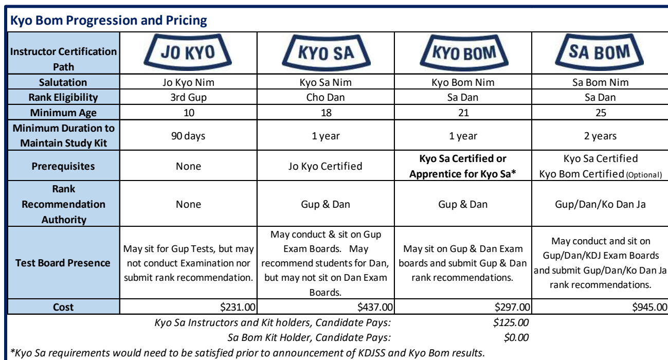
TABLE 1 OF 2